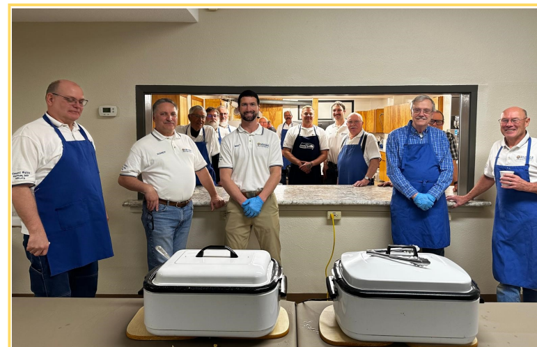
The Knights of Columbus served a Pancake Breakfast on Palm Sunday, the 29th of May 2026; a vital tradition for fellowship, connecting generations, and building parish community.