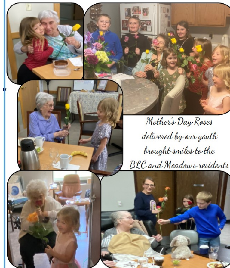
Mother's Day Roses delivered by our youth brought smiles to the BLC and Meadows residents

FREE-WILL OFFERING + SILENT AUCTION ALL SUPPORT AND PRAYERS APPRECIATED.